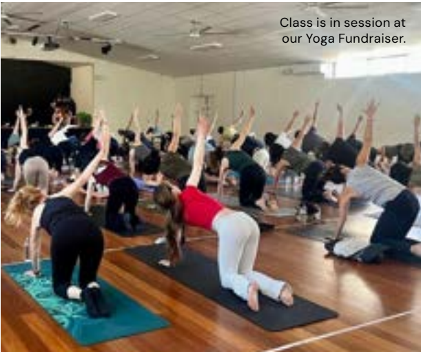
Class is in session at our Yoga Fundraiser.