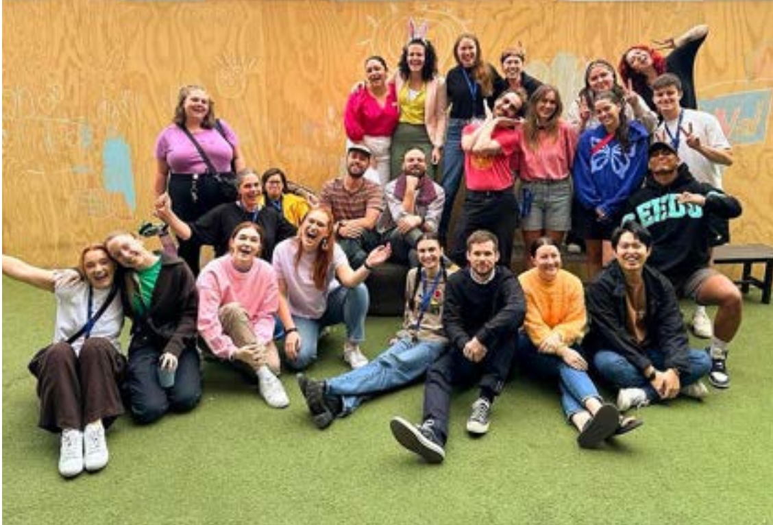
Staff embrace our Term 1 Dress Up Day theme—Colourful!