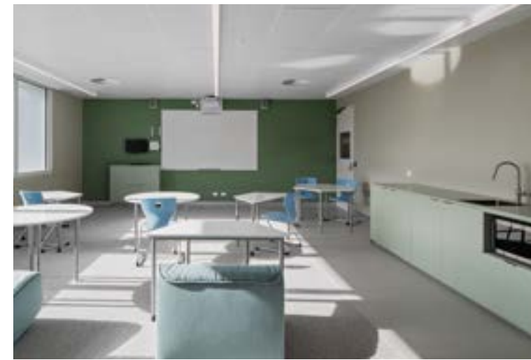
Colour and material choices were key in the creation of calm spaces to provide nurturing environments for the students.