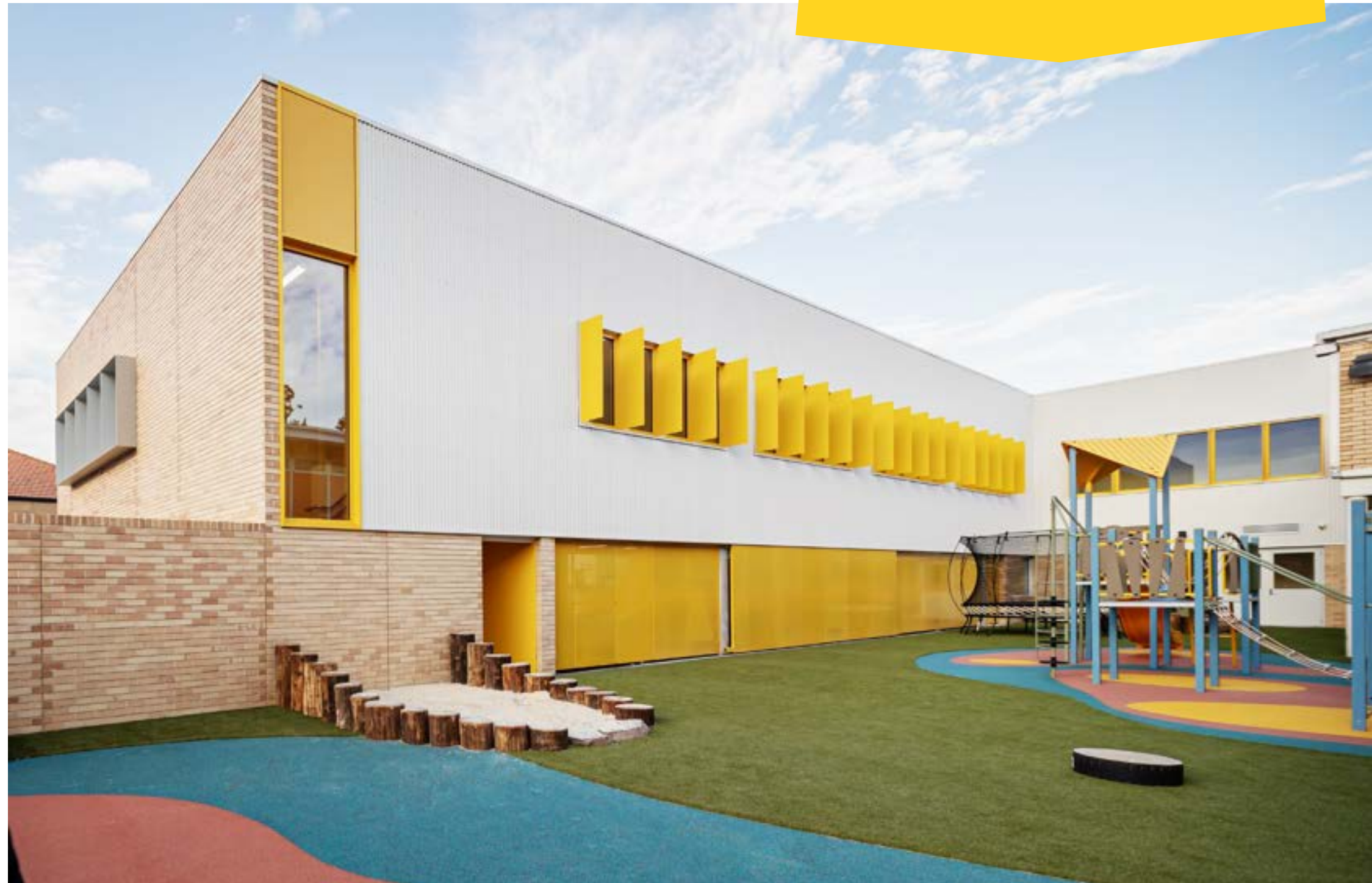
Our brand new outdoor area equipped with trampoline, play equipment, sandpit and swing set for out kids to enjoy.

GIANT thanks to the Helen McPherson Smith Trust who provided a grant to cover the cost of the new furniture to fit out the classrooms and staffroom. We will forever be grateful for this gift and admire our gorgeous looking pieces every day!