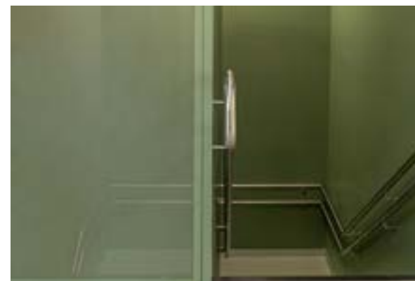
Colour coded hallways and stairs help everyone to navigate the building.