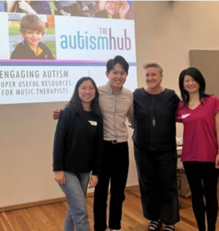
Our incredible music therapists sharing resources through The Autism Hub workshops.

Staff professional learning was a highlight of the year. Three teachers and therapists progressed through our accreditation framework. A leader completed a Masters of Education in Inclusion and Diversity at La Trobe University, and a teacher gained full registration with the Victorian Institute of Teaching. Achievements also included a research project being presented at the International Society of Autism Research (INSAR) conference that highlighted the importance of a trans disciplinary approach to supporting children with challenging behaviours and a Bronze Medallion lifesaving award and Behaviour Support Practitioner training for two educators, enhancing our capacity to support complex behaviours and expand Health and Physical Education programs.