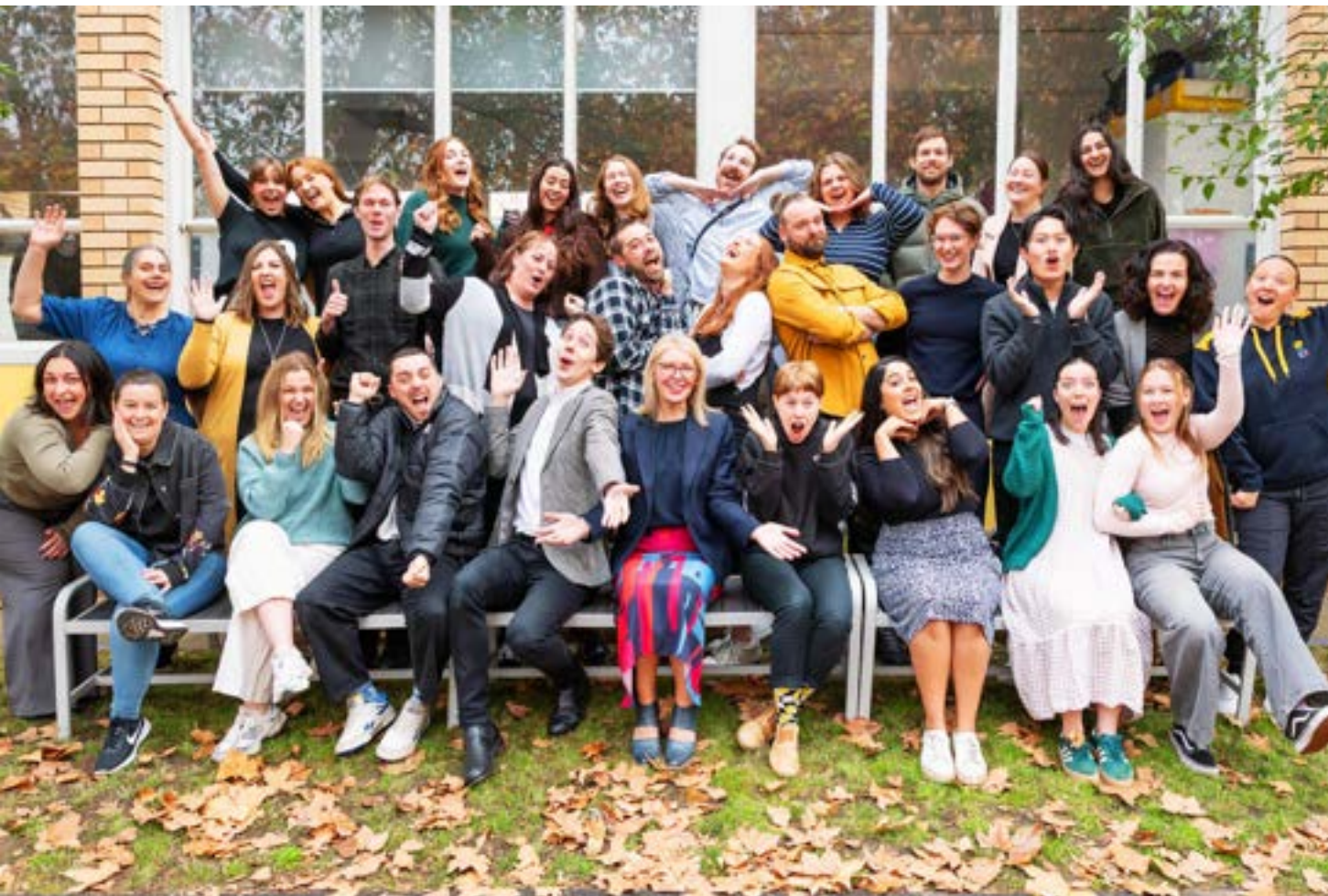
Our brilliant school team.

Driven by passion and a culture that celebrates growth, our vision is to continue delivering education and programs to a group of vulnerable Victorians who are too often overlooked by the system. Everything we do—in education, therapy, and community—is designed to create real, lasting change for our students and their families. It’s how we stay focused on what matters most.