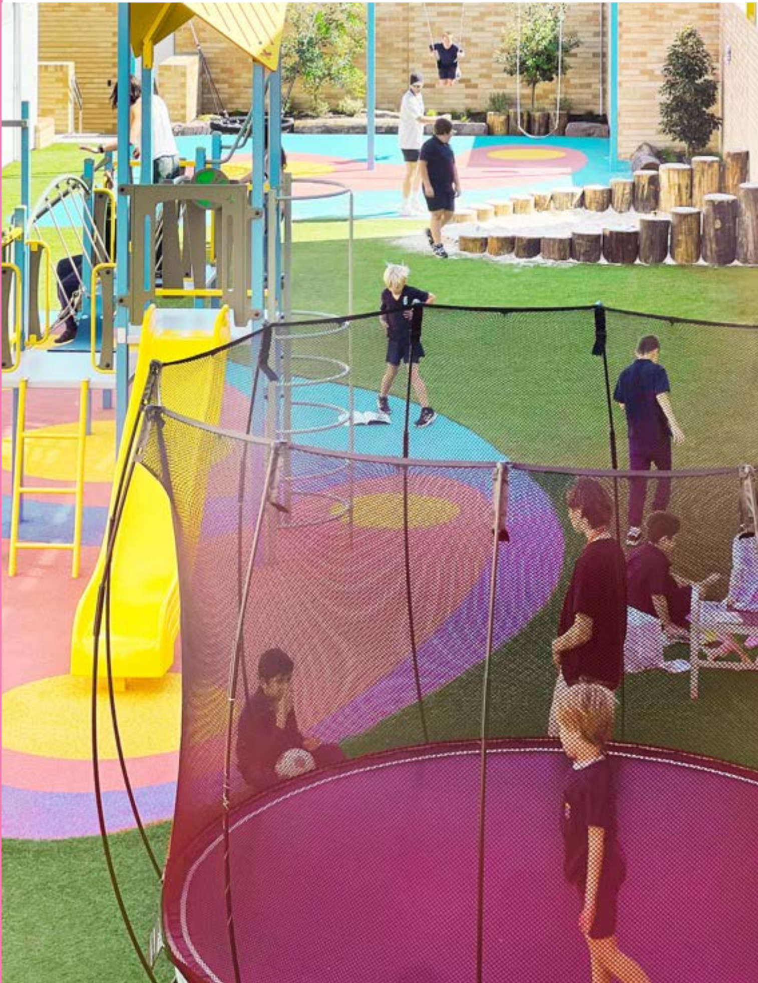
Playtime has been transformed by our new outdoor area and play equipment.

Our growing recognition, reflected in increasing requests for outreach, professional learning through our Autism Hub, and invitations to present at international conferences, is a testament to our steadfast dedication. We harness the strength of our transdisciplinary expertise, think creatively, and continually push boundaries to redefine what’s possible in autism education and support.