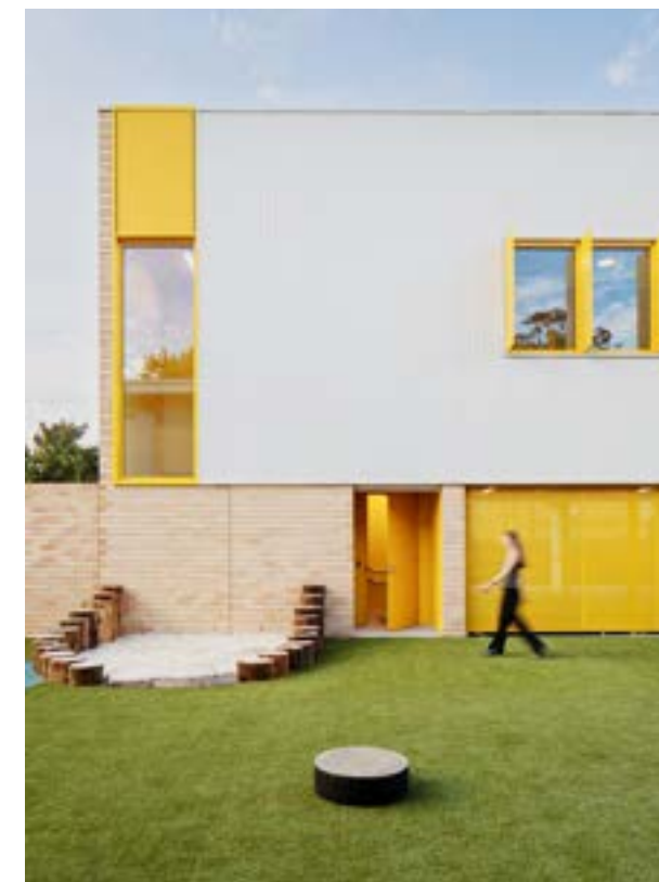
A sense of joy and playfulness through the flexible learning areas.