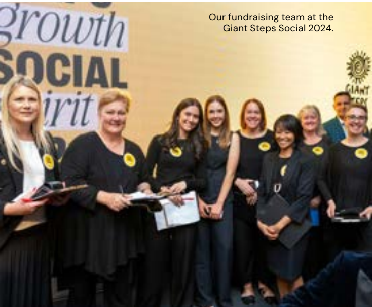
Our fundraising team at the Giant Steps Social 2024.