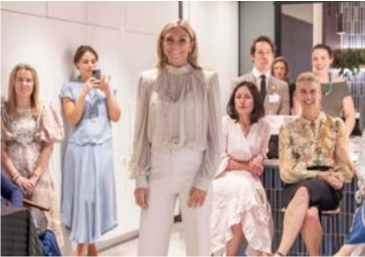
Fancy frocks at the Morgan Stanley Fashion Soiree.