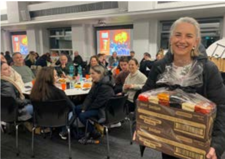
Funky bunch trivia night.