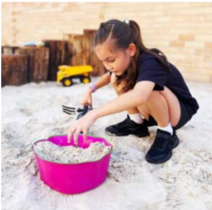
Malayah in our new playground sandpit.

‘What we offer is not only education, but understanding. We look beyond the individual to support the whole family’