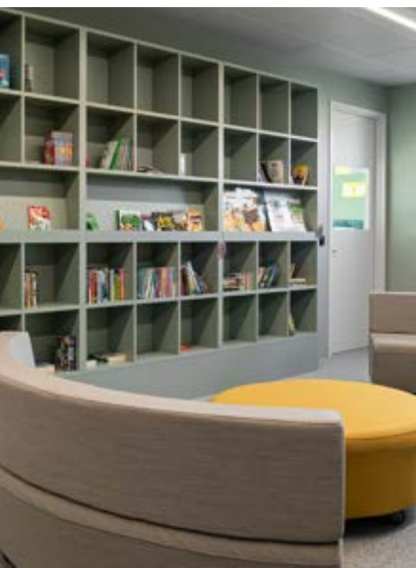
Our brand new library.